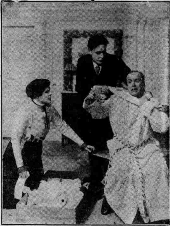
Scene from the annual laugh festival 'Fair and Warmer' by Avery Wood at the Grand Theatre tonight.