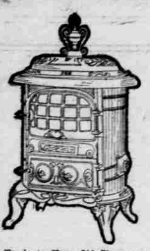
Trade in Your Old Stove or Furniture,

Heaters, Ranges and Dining Room Furniture for Thanksgiving. If you have not already purchased that needed Heater or Range, or Table and Chairs, see the display in our East and West Windows and you will hesitate no longer.