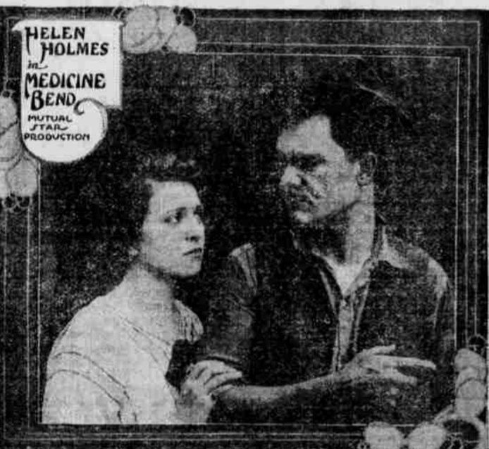
Big 5 reel Special Mutual production at the Bligh today, tomorrow and Saturday.

Wedding Invitations, Announcements and Calling Cards Printed at the Journal Job Department.