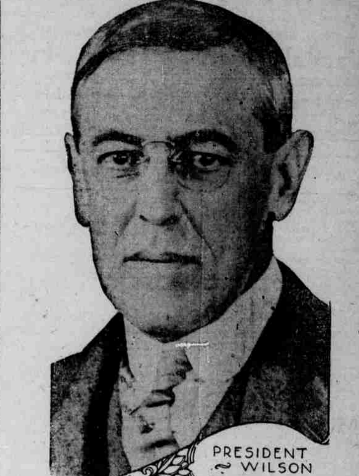
PRESIDENT WILSON

Henry Ford sums up his reasons for supporting the president thus: