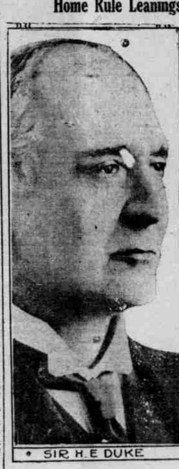
SIR H. E. DUKE

Sir Henry Edward Duke, the new chief secretary for Ireland, is credited with strong home rule leanings. This despite the fact that he is a member of the Unionist party. In a speech in the house of commons some two or three years ago he urged a home rule settlement. The sentiment he repeated in a recent speech in Exeter. Sir Henry Edward Duke is a barrister and Unionist member of parliament for Exeter and succeeded Augustine Birrell, who resigned after the Irish uprising. The new chief secretary has been given a seat in the cabinet. No new lord lieutenant of Ireland will be appointed to succeed Lord Wimborne, who also resigned after the outbreak of the Dublin rebellion.