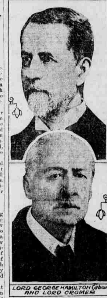
LORD GEORGE HAMILTON (above) AND LORD CROMER