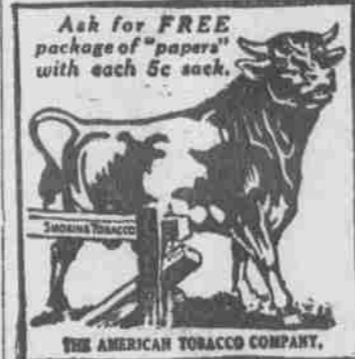
Ask for FREE package of "papers" with each 5c sack. THE AMERICAN TOBACCO COMPANY.

Leads to "roll your own" with "Bull" Durham—a few trials will do it—and you'll get far more enjoyment out of smoking.