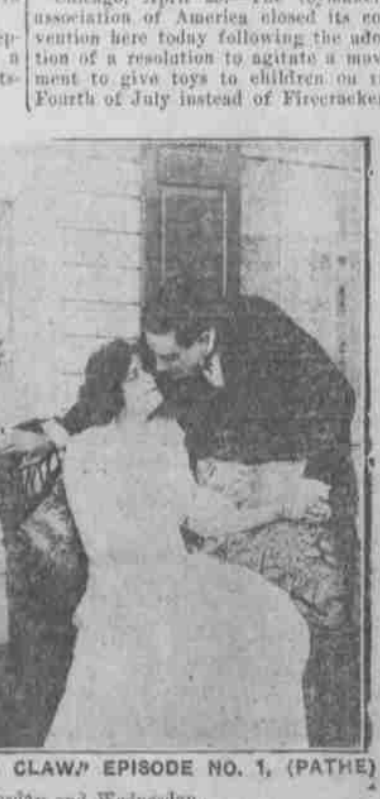
A SCENE FROM "THE IRON CLAW" EPISODE NO. 1, (PATHE) Starting at the Bligh Theatre Tuesday and Wednesday.

WANT TOYS TO TAKE PLACE OF FIRECRACKERS ON 4TH Chicago, April 29.—The toy-makers' association of America closed its convention here today following the adoption of a resolution to agitate a movement to give toys to children on the Fourth of July instead of firecrackers.