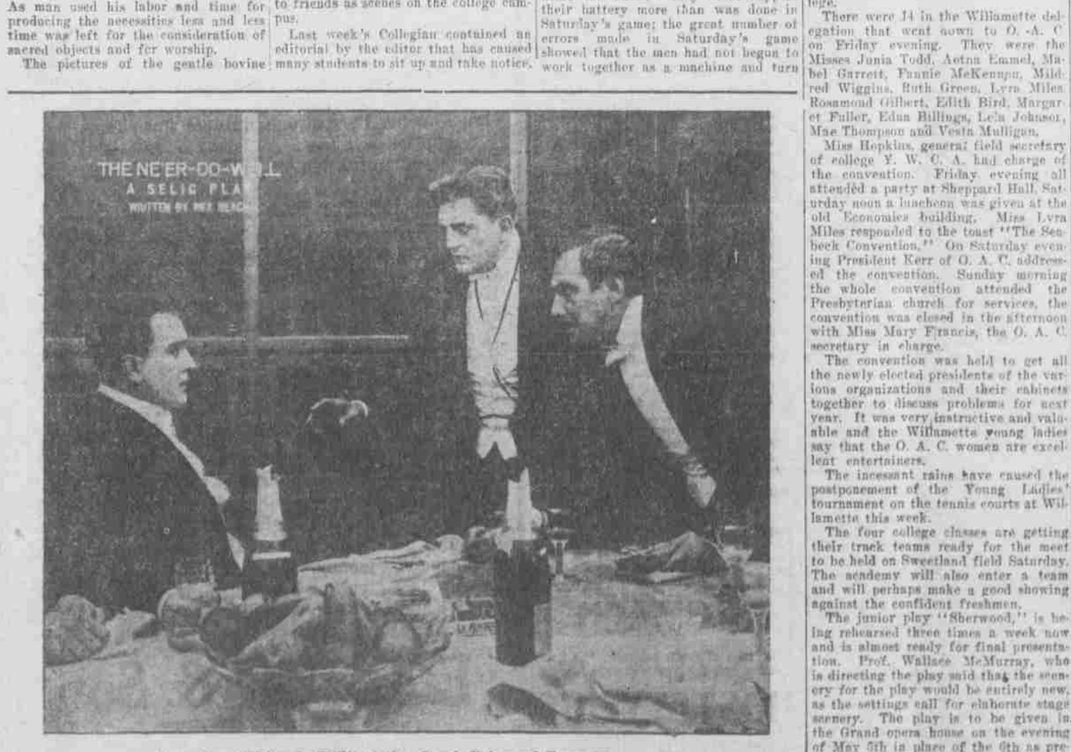
Scene from "Ne'er Do Well" at the Grand, Today and Tomorrow