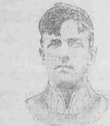
CHRISTY MATHEWSON Famous Baseball Pitcher, says: "Tuxedo gets to me in a natural, pleasant way. It's what I call good, honest, companionable tobacco—the kind to stick to."

YOU CAN BUY TUXEDO EVERYWHERE Convenient, glassine wrapped, moisture-proof pouch . . . 5c Famous green tin with gold lettering, curved to fit pocket 10c In Tin Humidors, 40c and 80c. In Glass Humidors, 50c and 90c. THE AMERICAN TOBACCO COMPANY