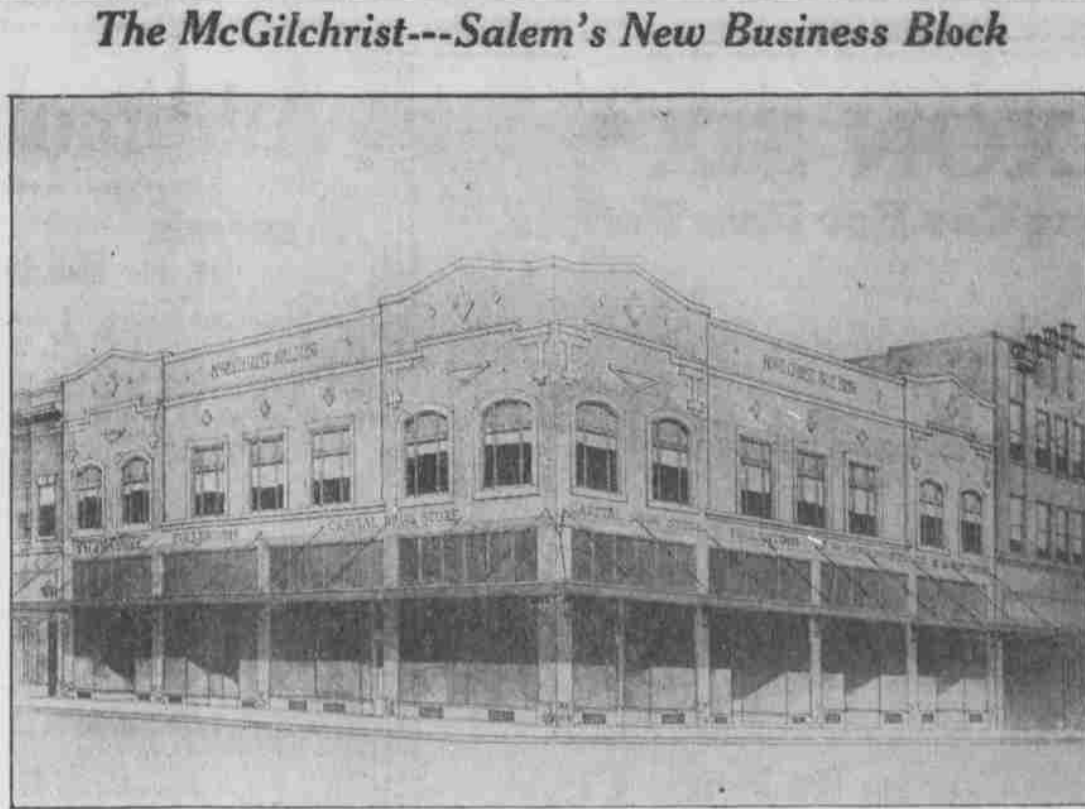
The McGilchrist building to be completed and occupied the latter part of the month is an evidence of the coming business prosperity due for Salem.