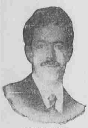
PRITZ KREISLER **I have certainly found in Tuesda the one and only tabacco that measures

—when you want a real smoke, get behind a pipeful of Tuxedo and watch all the big and little Worries that have been a-besieging you, evacuate their trenches and make a rushin' advance to the rear. Those fragrant whiffs of "Tux" make them feel too joyful—no selfrespecting Worry can stand for that.