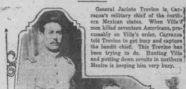
General Jacinto Trevino (standing) and General Carranza.

General Jacinto Trevino is Carranza's military chief of the northern Mexican states. When Villa's men killed seventeen Americans, presumably on Villa's order, Carranza told Trevino to get busy and capture the bandit chief. This Trevino has been trying to do. Hunting Villa and putting down revolts in northern Mexico is keeping him very busy.