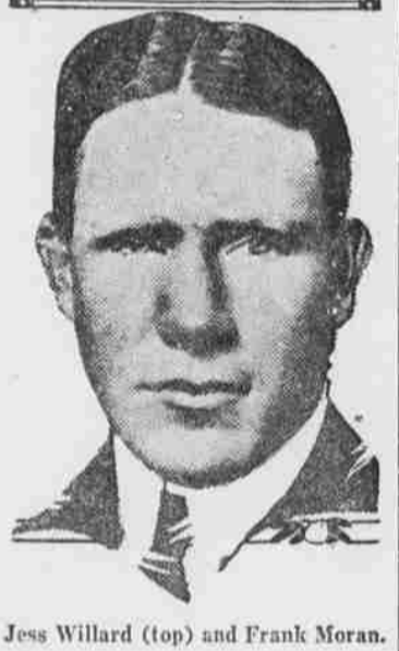
Jess Willard (top) and Frank Moran.

Though Jess Willard would have nearly thirty pounds in weight to the good over Frank Moran if the bout proposed for New York this spring comes to pass, it's no certainty that the big champion wouldn't have his hands full.