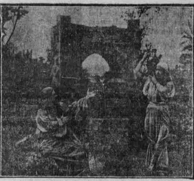
A SCENE FROM "THE LIFE OF OUR SAVIOR" (PATHE)

DAY AND TOMORROW ereation the glorious realization of a