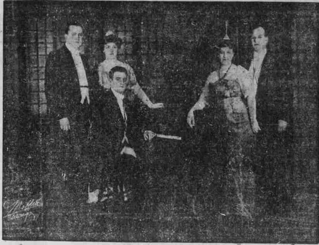
The Oxford Company, who will appear in scenes from Grand Opera tonight in the Armory.