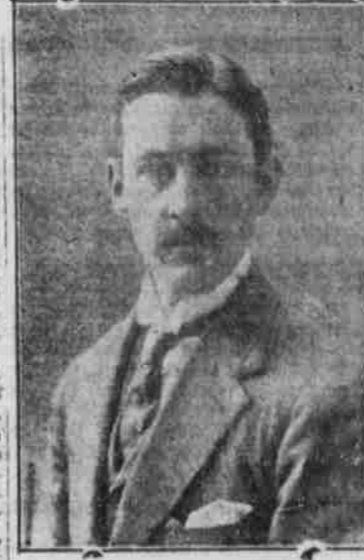
John Barrymore. Who appears at the Grand theatre Friday and Saturday in that exciting funny comedy, "The Incurrible Dukane."