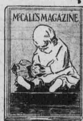
FREE McCALL PATTERN

Don't Miss This Offer Write or call at the office of this paper