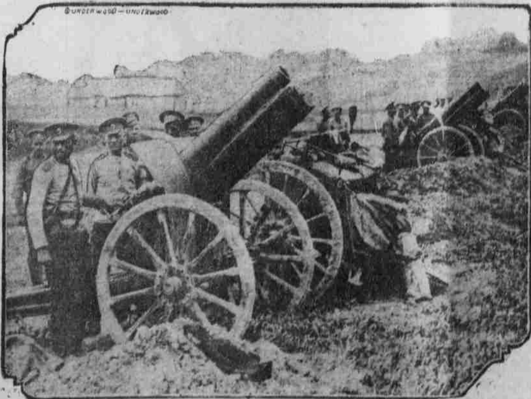
Russian howitzer battery, photographed "somewhere along the Polish front."