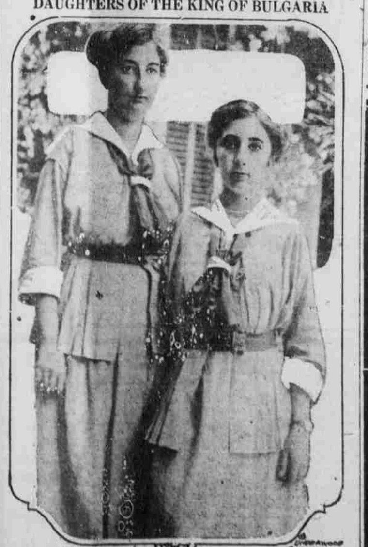
Princess Endoxia (left) and Princess Nadejda. This picture of the two charming daughters of the king of Bulgaria is of particular interest just now, as their father is believed to be on the verge of entering the European war. The Princess Endoxia was born in 1895 and her sister was born the year following.