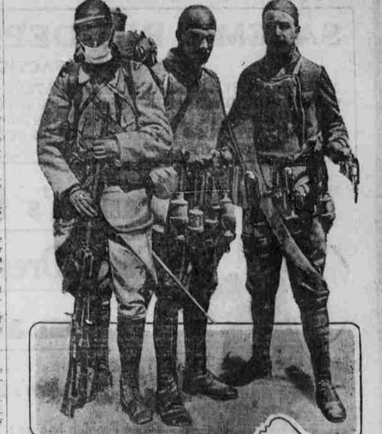
Twentieth century infantry armored and armed.

Features of the war which have attracted universal surprise and attention have been the way in which long obsolete battle-weapons and defensive armor have again been resorted to.