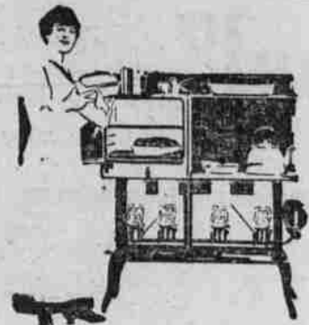
Gas Stove Convenience with Kerosene