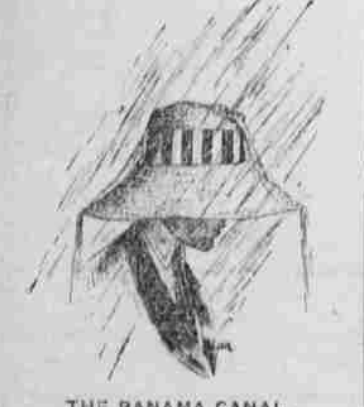
THE PANAMA CANAL.

Largest Sale of Any Medicine in the World. Sold everywhere. In boxes, 10c., 25c.