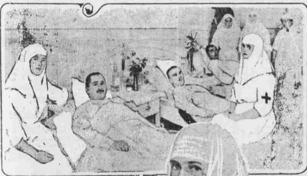
Top, Czarina and her daughters, the Grand Duchesses Olga and Tatiana, entertaining wounded soldiers. Bottom, autographed portrait of the Empress of Russia as a Red Cross sister.

The Czarina of Russia is setting a wonderful example to all the royal households of the warring nations of Europe. While other queens and princesses have done much to help the stricken people and wounded soldiers of their countries, the Czarina has devoted all her time and resources to aid and has gone in person as a Red Cross nurse into the hospitals. With her in the service of the injured are her daughters, the Grand Duchesses Olga and Tatiana.