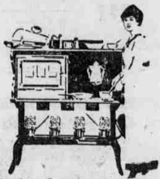
Gas Stove Convenience with Kerosene