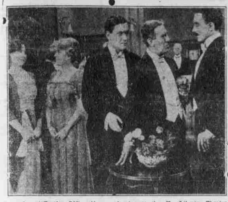
Scene from "Brother Officers" now showing at the Ye Liberty Theatre.