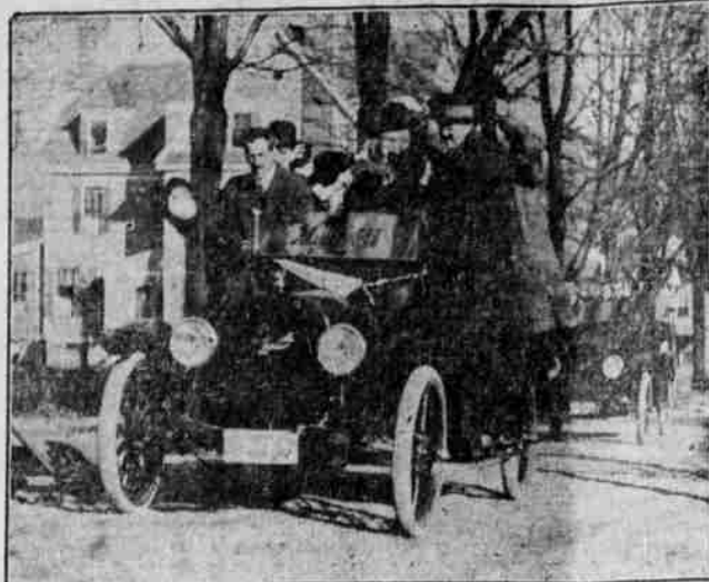
All New England is still talking of the remarkable feat performed by a 1915 Maxwell in Boston during show week. Thirteen men, weighing a total of 2075 pounds, were carried up Boston's most famous climb—Cory Hill—in one minute, twenty-seven seconds. The distance covered was one thousand yards, and the grade over twenty percent. The sturdy Maxwell never faltered on its trip, which was witnessed by thousands of show visitors, and officially timed by newspaper men. After the ascent the car, with its load of 225 pounds greater than its own weight, was headed down the hill and a wonderful exhibition of braking power was given. The test was considered so remarkable that newspaper photographers swarmed the scene and motion pictures were made for a famous Motion Picture Weekly.