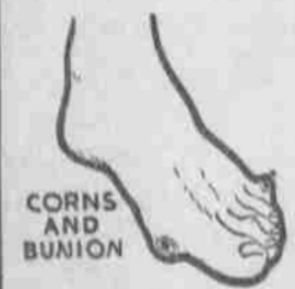
CORNS AND BUNION