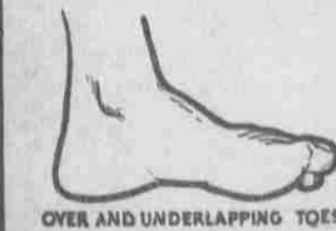
OVER AND UNDERLAPPING TOES