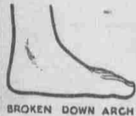
BROKEN DOWN ARCH