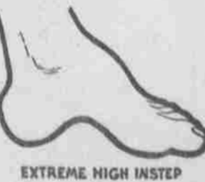
EXTREME HIGH INSTEP