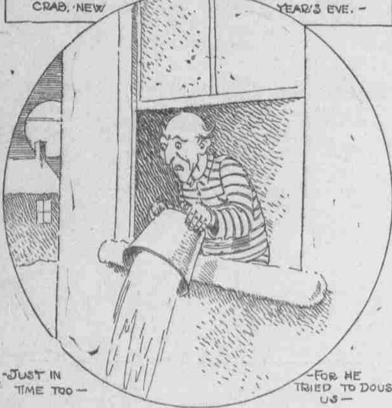
JUST IN TIME TOO.