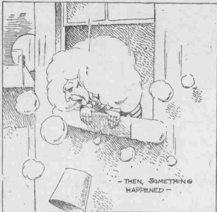
THEN, SOMETHING HAPPENED.