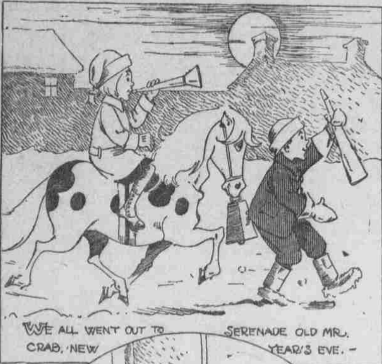
WE ALL WENT OUT TO SERenade OLD MR. CRAB, NEW YEAR'S EVE.

World Color Printing Co., St. Louis, Mo.