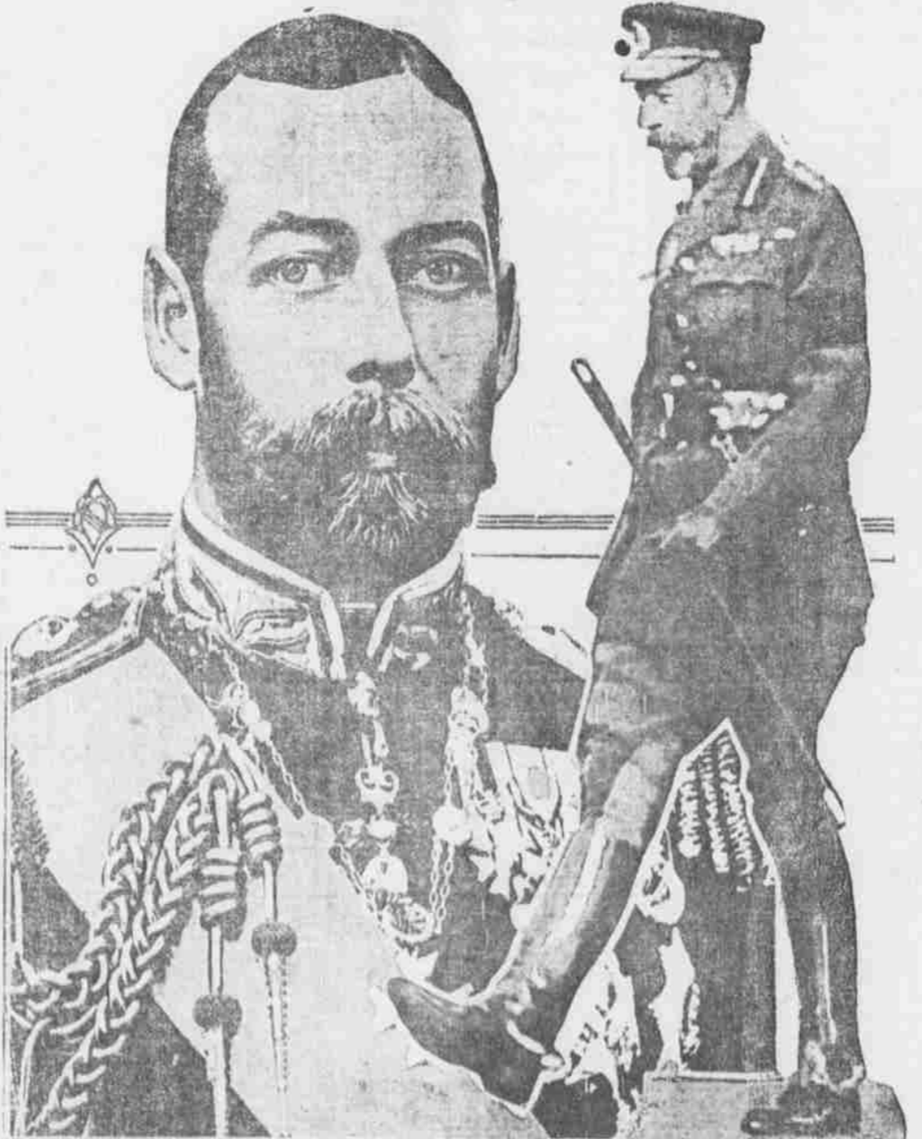
KING GEORGE, OF ENGLAND...

King George is at the western battle front in France. His presence among his soldiers on active service in a foreign country is an event of historic interest. The last occasion on which an English sovereign played a part in actual warfare was when King George II, with an Anglo-German army, fought the French, under Marshal Noailles, in the battle of Dettingen, showing personal courage during the fighting, but poor generalship. Since then the old practice of an English monarch leading the forces in the field has been abandoned. Although the kings have been kept aloof, members of the British royal family have, however, been at the front in a good many of England's recent wars. Thus the Duke of Cambridge was at Sebastopol in the Crimea, the Duke of Connaught commanded a brigade in the first Egyptian war, and both the Prince of Wales and Prince Arthur of Connaught are now on Field-Marshal Sir John French's staff. With the appearance of King George V at the front all of the rulers of the warring nations except Francis Joseph—the Kaiser, King Albert of Belgium, President Poincaré and the kings of Montenegro and Serbia—have been in the field.