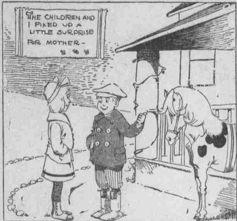
- I CARRIED -

World Color Printing Co., St. Louis, Mo.