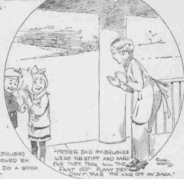
- MOTHER SAID MY BRUSHES WERE TOO STIFF AND HARD FOR THEY TOOK ALL THE PAINT OFF! FUNNY THEY DON'T TAKE THE HAIR OFF MY BACK!