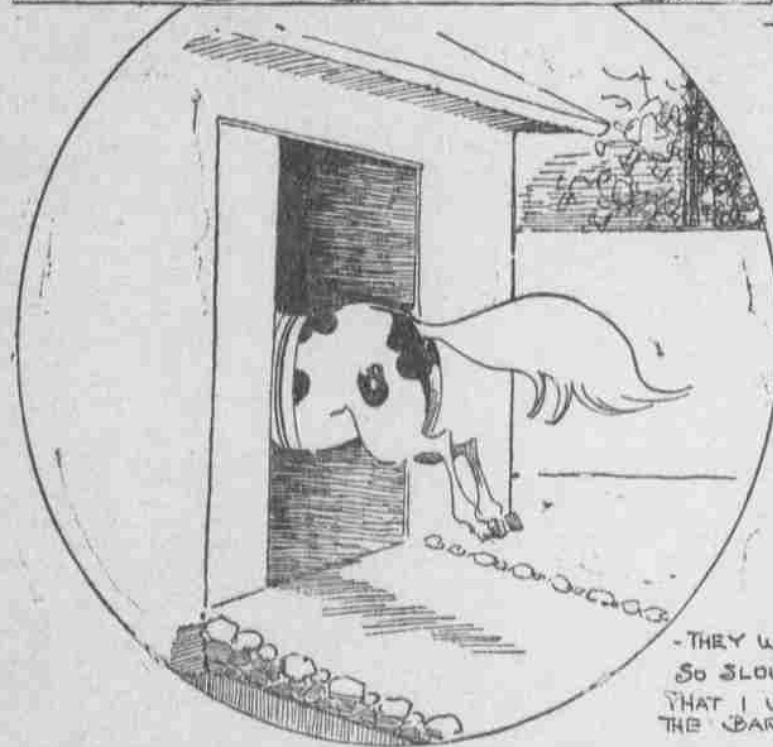
- THEY WERE SO SLOW AT IT THAT I WENT TO THE BARN AND -