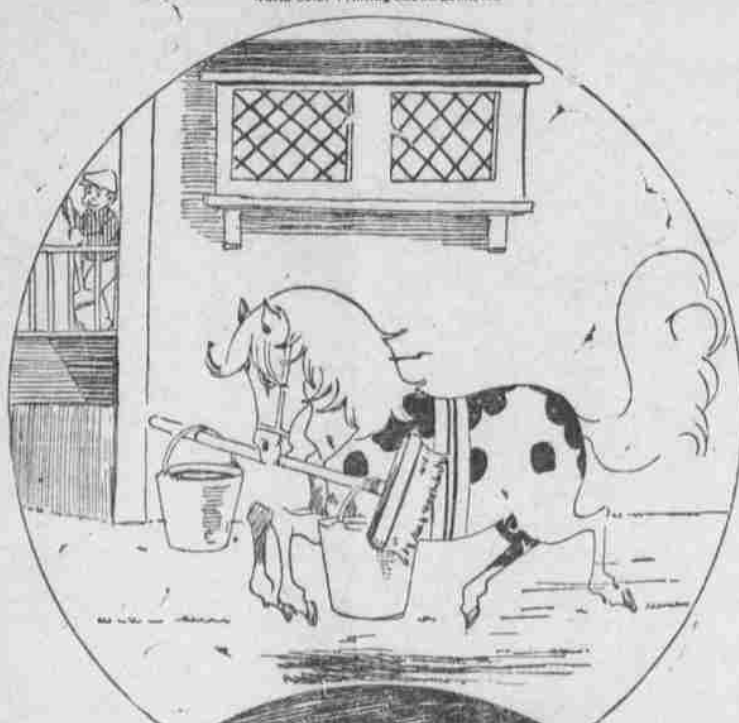
THE WATER -