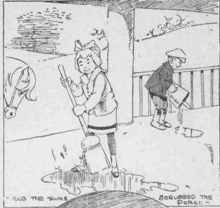
AND THE TAINE