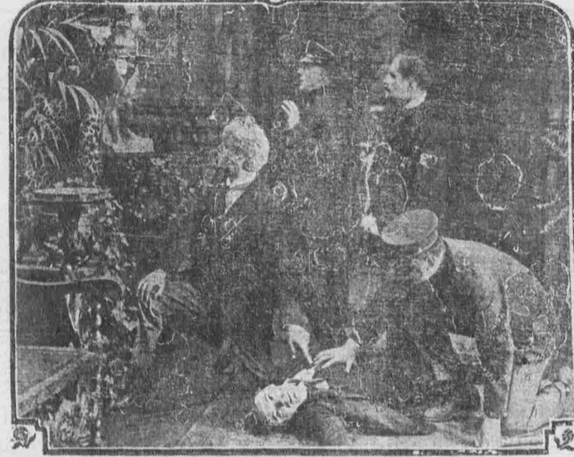
THE ESCAPE OF COUNTESS OLGA