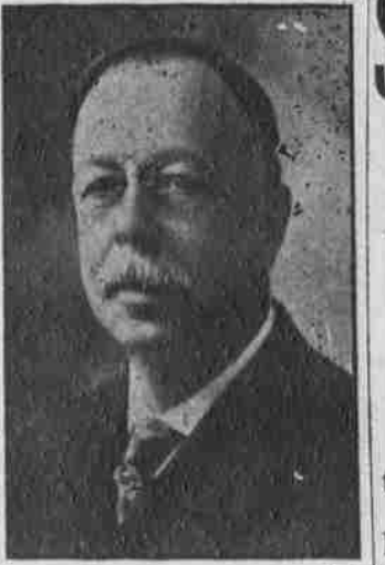
GEO. E. CHAMBERLAIN Democrat, re-elected to the United States senate by a large majority.

The democrats were victorious in their gubernatorial fight in New York, Ohio, Colorado, Connecticut and New Hampshire and still had a chance today in Kansas, the result there being very close.