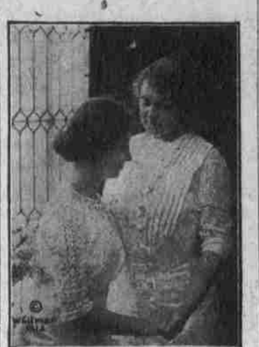
Helen Keller and Miss Macy.

Helen Keller in her first appearance in Salem at the Grand opera house on March 30, will show the general public the sensitiveness of her hands, which her friends have been familiar with for years.