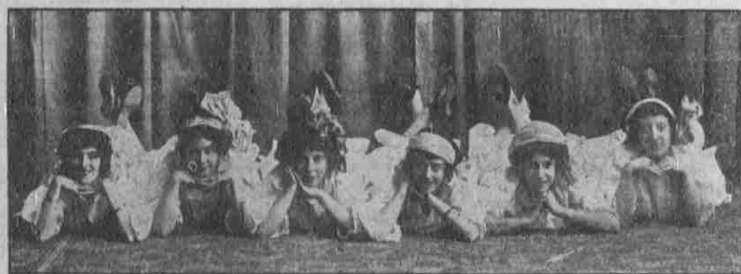
The Brownie Girls, Singing and Dancing Chorus

With L. S. Barnes & Co. 315-316 Masonic Temple. If you have bargains to offer, list with us.