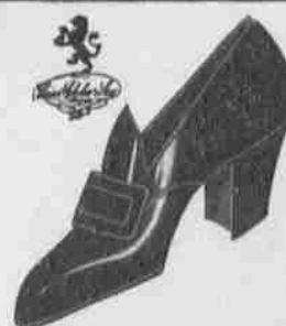
Colonial Pumps, longer and narrower toes, in Patent, Satin, with Cuban and Cuban Louis heels.