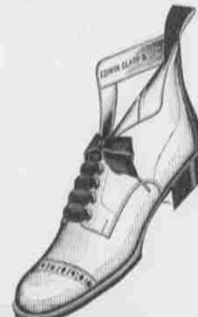
Men's Kangaroo, Vies Kid, Velour Calf. Made by Edwin Clapp & Son.