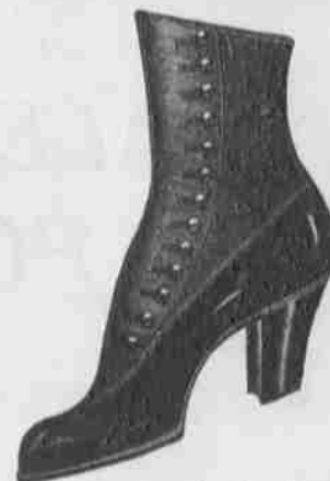
Ladies Patent Colt, Gun Metal, and Buckskin.