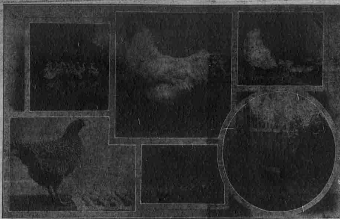
Photographs of some the varieties of poultry shown here.