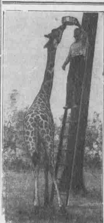
"Long Tom," said to be the tallest giraffe in captivity, to be here with Ringling Bros' menagerie, August 23.

The makers of Lydia E. Pinkham's Vegetable Compound have thousands of such letters as those above—they tell the truth, else they could not have been obtained for love or money.