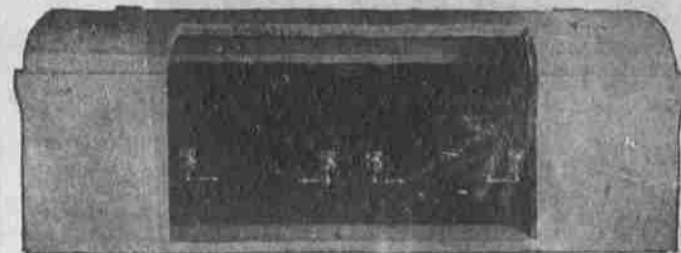
The New Way.

The Vault with- out a fault--The best in the world. Made in Salem.