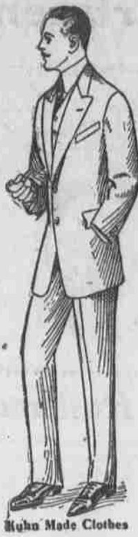
Milano Made Clothes

Of America's ready-tailored garments. The fabrics are the most popular weaves. To make room for our large stock of men's clothing we offer our present stock 25 per cent less