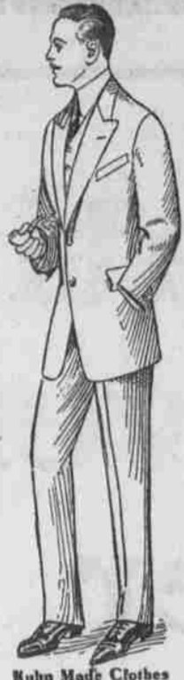
Kuhn Made Clothes