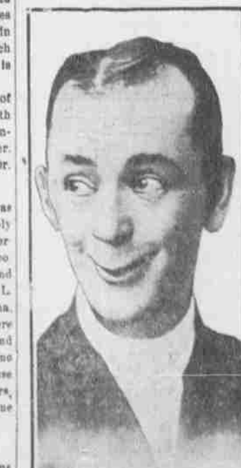
Eddie Foy, in "Over the River," Opera House Wednesday, May 28.

Piles Cured in 6 to 14 Days. Your druggist will refund money if PAZO OINTMENT fails to cure any case of Itching, Blind, Bleeding or Protruding Piles in 6 to 14 days. 50c