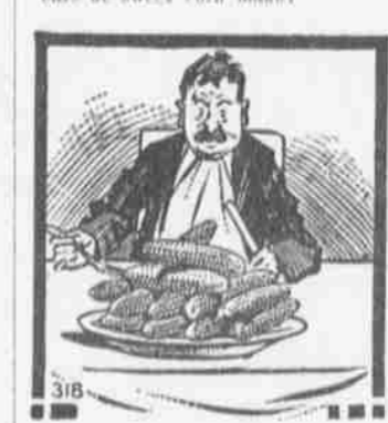
Coru meal, of course!