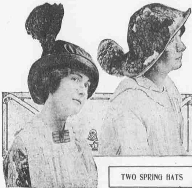
TWO SPRING HATS

THE novelty of the millinery world is the new shape known as the aeroplane. The model illustrated here will give a good idea of what this hat is like. It is in this case trimmed with pheasant's feathers and has an ornament of pheasant's feathers at the back, which suggests the propeller of an airplane. The other hat is a simple model in hemp, with a satin crown and an upright tuft of ostrich tips.