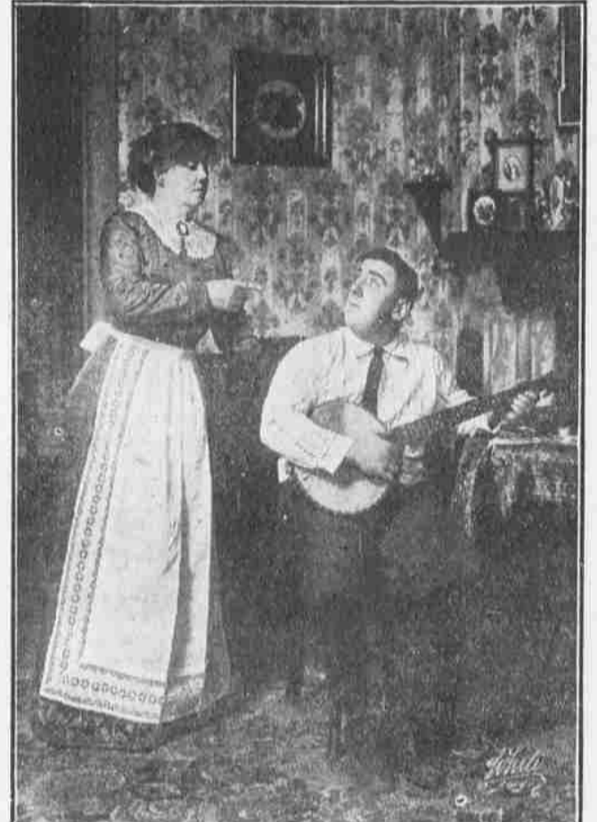
Scene from George M. Cohan's Sensational Play, "Broadway Jones."