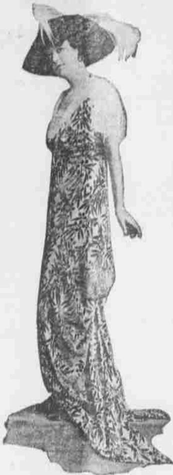
OF SILVER AND ROSE BROCADE.

Drapery Almost Classical on Evening Frocks.