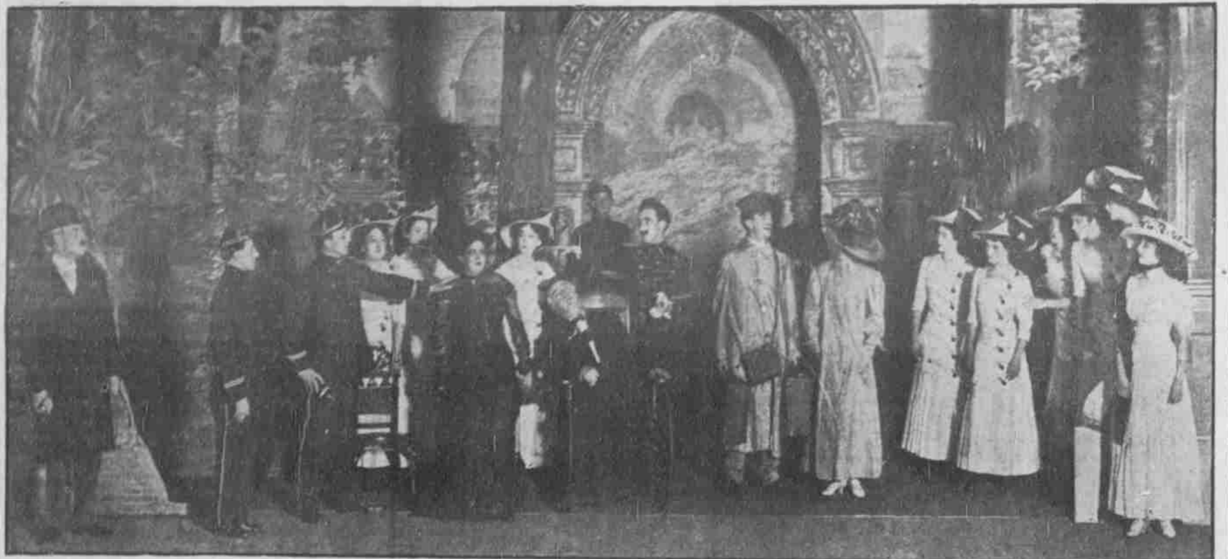
SCENE FROM THE GIRL FROM U. S. A. AT THE GRAND MONAY NIGHT.