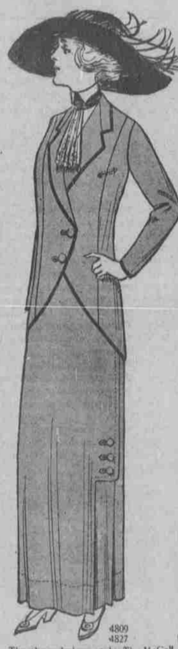
The above designs are by The McCall Company, New York, Designers Makers of McCall Patterns.

Planted Skirts. Accordion planted skirts have appeared again and seem to be gaining favor, also one sees a good deal of a model that has a platted flounce falling in close straight lines about the feet. The overkirt is just a tight fit-