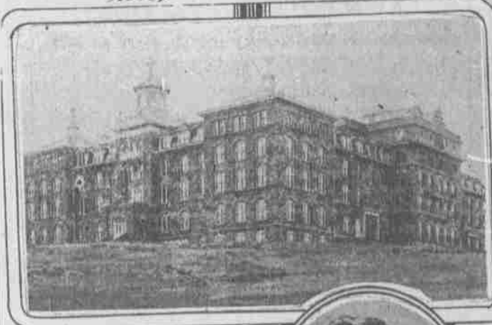
Mt. Angel College

Arrangements are practically complete for the celebration of the silver jubilee of Mount Angel college, which will be held on June 17, 18 and 19. Many of the old students who, during the 25 years of the existence of the college, have gathered there for instruction and inspiration, will return once more to their alma mater to renew old associations and acquaintances. Many of their old professors will also be there to greet them.