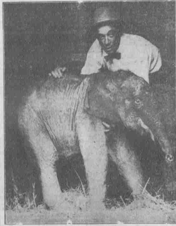
Is First of This Pachyderm Family Bred and Born on American Soil—Salinas, California Makes Present to Mother and Son.

The one great event in the big tents that startled the scientific world.