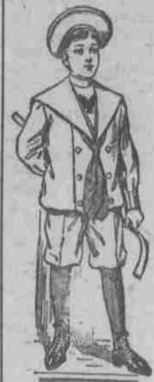
Kuhn Made Clothes