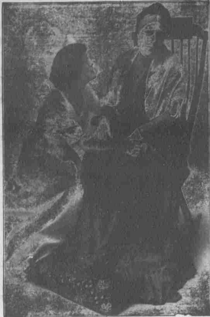
Scene in "Rebecca of Sunnybrook Farm."